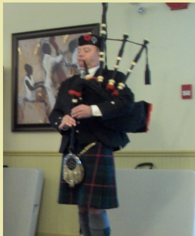
Remembrance Day Ceremony