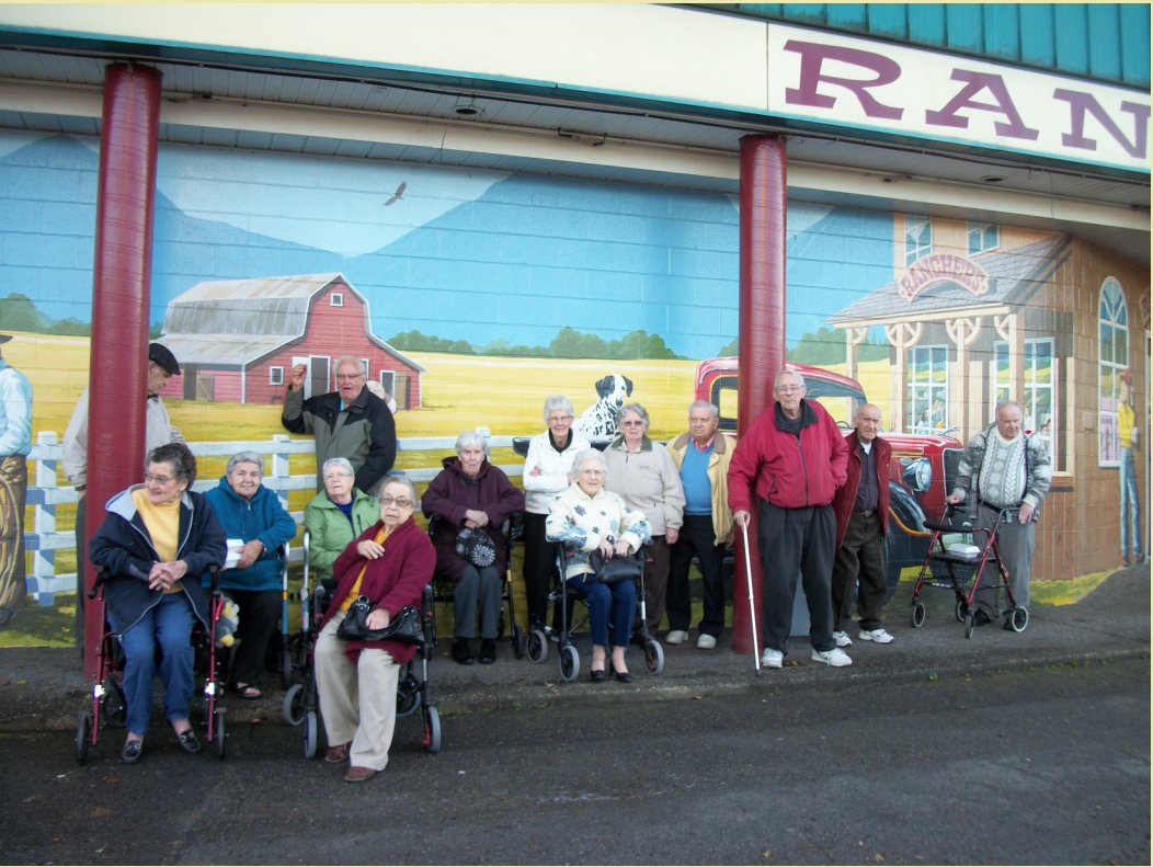
Trip to Bridal Veil Falls