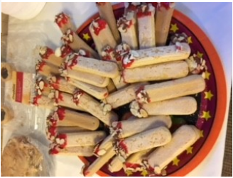
Halloween Fun at Arbourside!