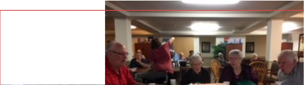
It took way too many tries to blow out these candles, as you can see by the gales of laughter emanating from our Birthday Celebrants.