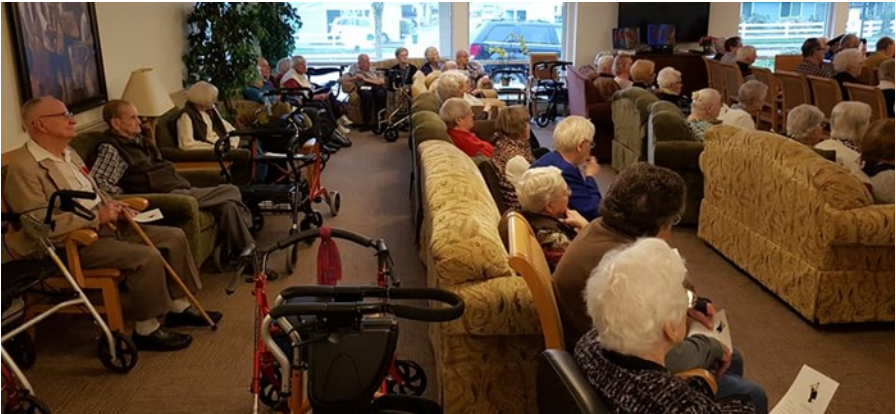
Receiving roses as a symbol of their altruism. We have 10 Veterans from WWII at Arbourside. We also payed homage to 29 Veterans who are related to Residents and Staff, or have passed on.