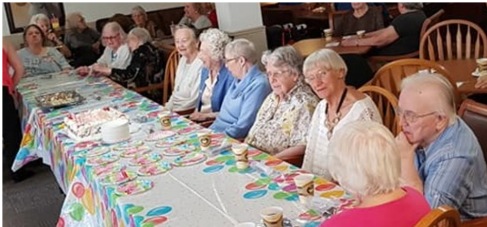
There were so many October Birthday Babies that we had to set up 3 tables to fit them all in. Luckily there was enough cake for everyone who attended!