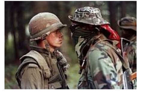
Standoff during the Oka Crisis, in 1990, was a clear demonstration of the patience, civility and loyalty of our great Canadian Forces.