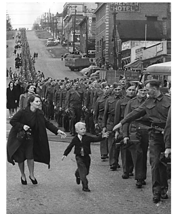
On October 1, 1940 as the The British Columbia Regiment (Duke of Connaught's Own) went to war.